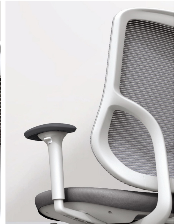
SHOWN: BLACK MESH WITH WHITE THREAD. GREY SEATPAD. WHITE FRAME.