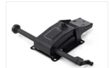
SYNCHRO MECHANISM LOCKING POSITIONS (4) BACK TILT (22°)