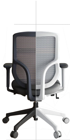
OTHER FINISHES AVAILABLE FOR PROJECT ORDERS