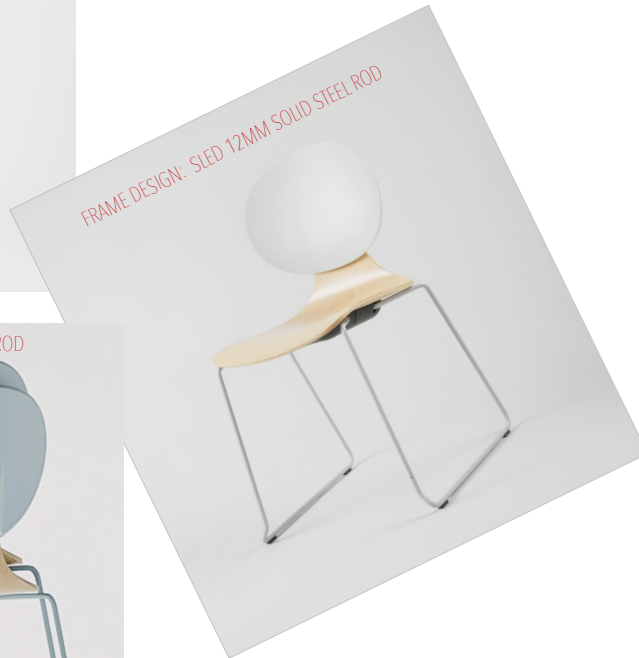
FRAME DESIGN: SLED 12MM SOLID STEEL ROD