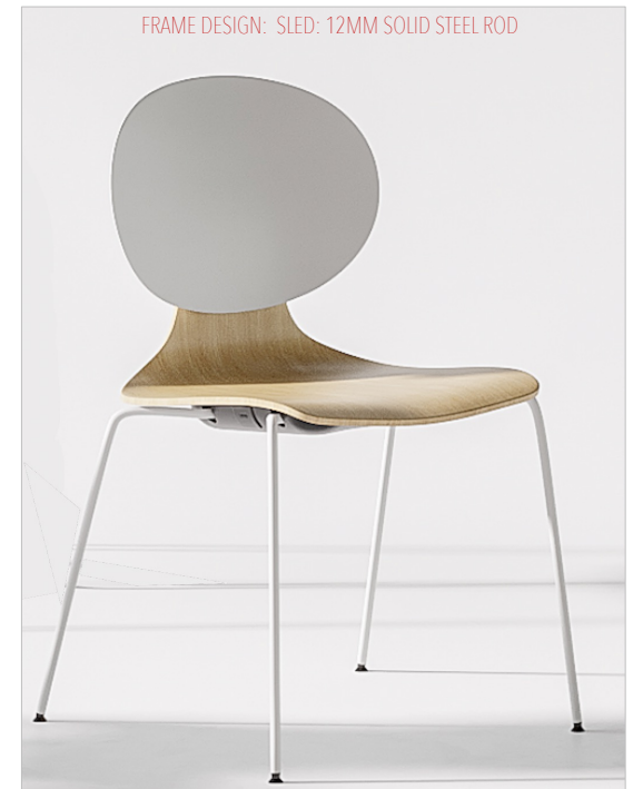
FRAME DESIGN: SLED: 12MM SOLID STEEL ROD

ALL IMAGES ARE ILLUSTRATIVE (view actual sample before final selection)