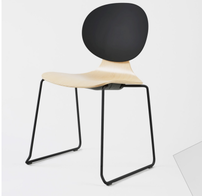
FRAME DESIGN: SLED: 12MM SOLID STEEL ROD